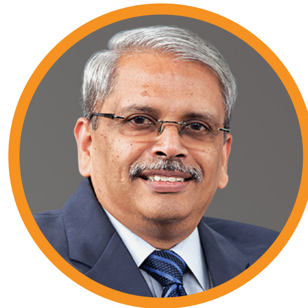
Senapathy "Kris" Gopalakrishnan Chairman, Axilor Ventures, Co-Founder, Infosys