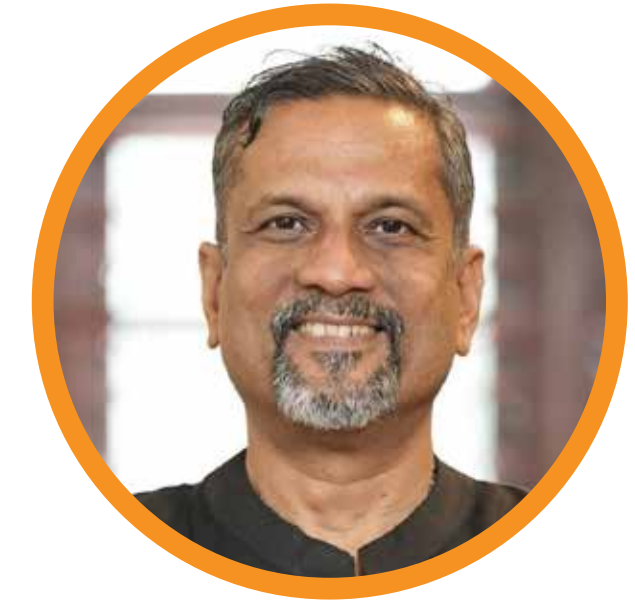
Sridhar Vembu Founder and CEO, Zoho Corporation