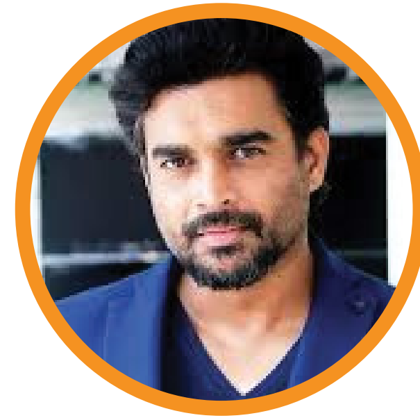
R. Madhavan Indian movie actor