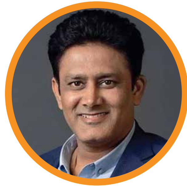
Anil Kumble Former Indian Cricketer