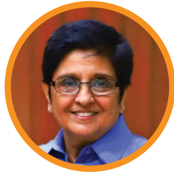
Dr. Kiran Bedi Retd. Police Officer Former Lt Gov Pondicherry