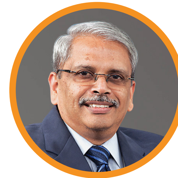
Kris Gopalakrishnan Chairman Axilor Ventures, Co-founder Infosys, President ISF