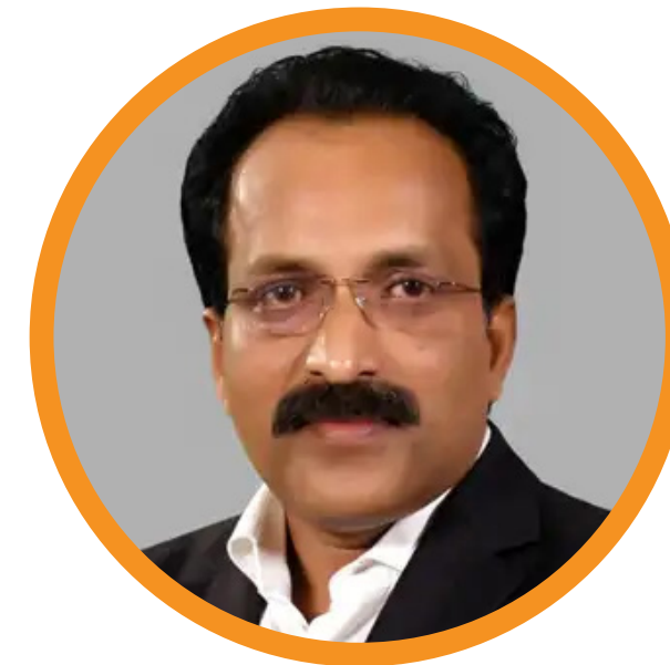
Dr. Somanath Former Director, ISRO