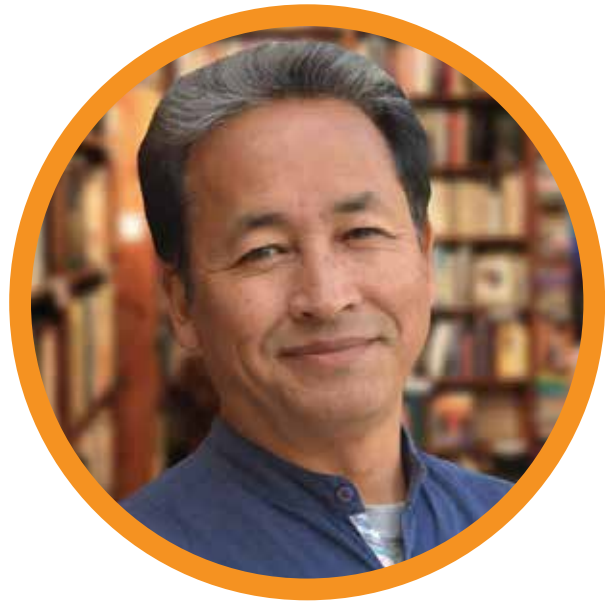
Sonam Wangchuk Indian Engineer, Innovator and Education Reformist