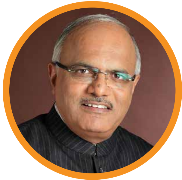
Dr. Vinay Sahasrabuddhe Member of Parliament