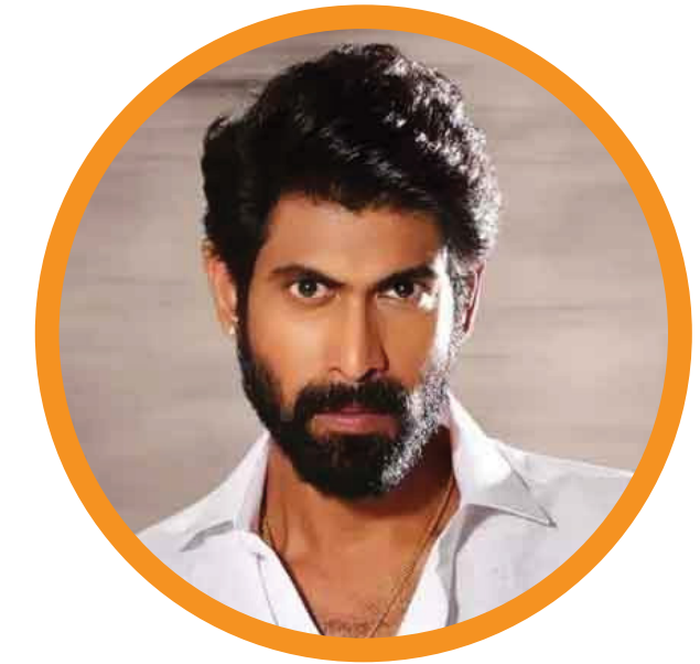
Rana Daggubati Indian movie actor