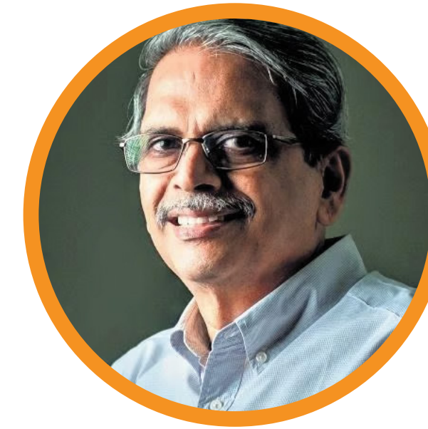
Kris Gopalakrishnan Co-founder, Infosys