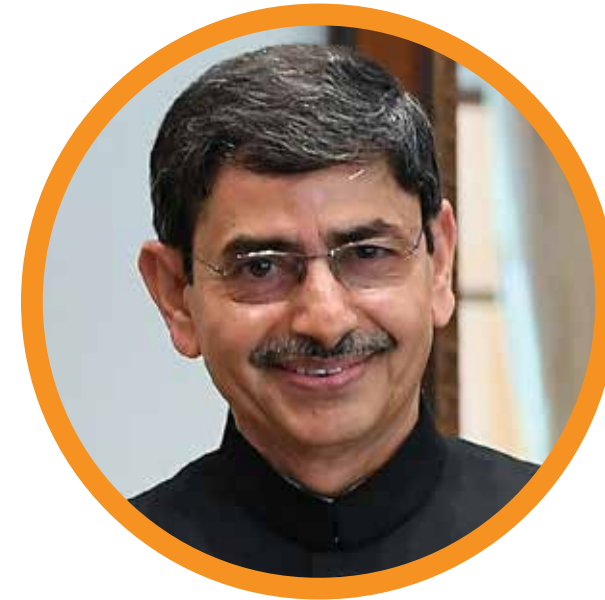
Thiru. R. N. Ravi Hon. Governor of Tamil Nadu